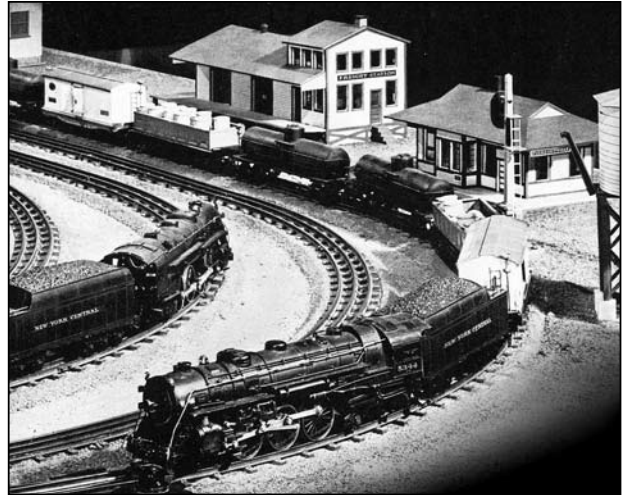
Scanned from 1942 Lionel Brochure